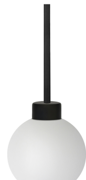
PENDANT/ 1/2 BATH