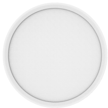
5" 7" 9" 15" LED DISC